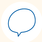
University Language Centre