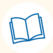
Bookshop and libraries