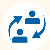
Internships and Placements